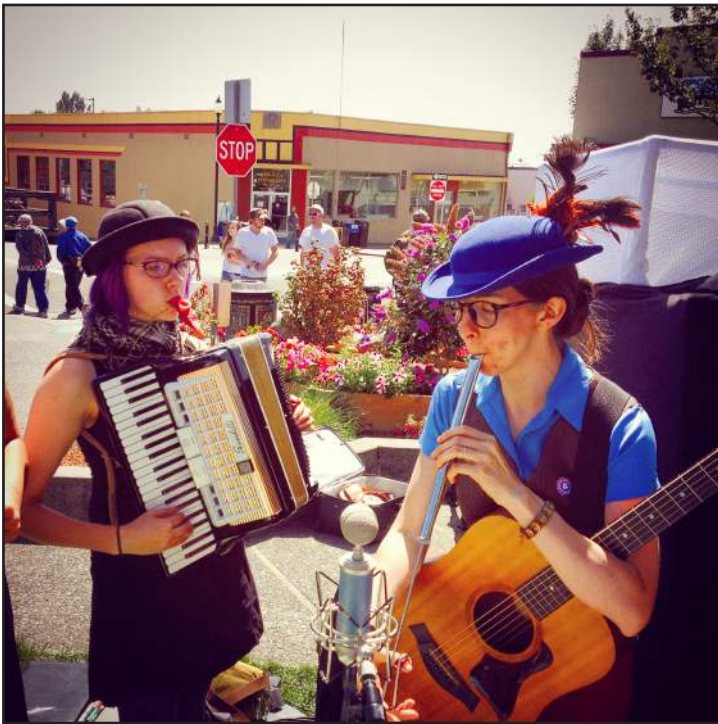
Live music and sound effects make each episode special.