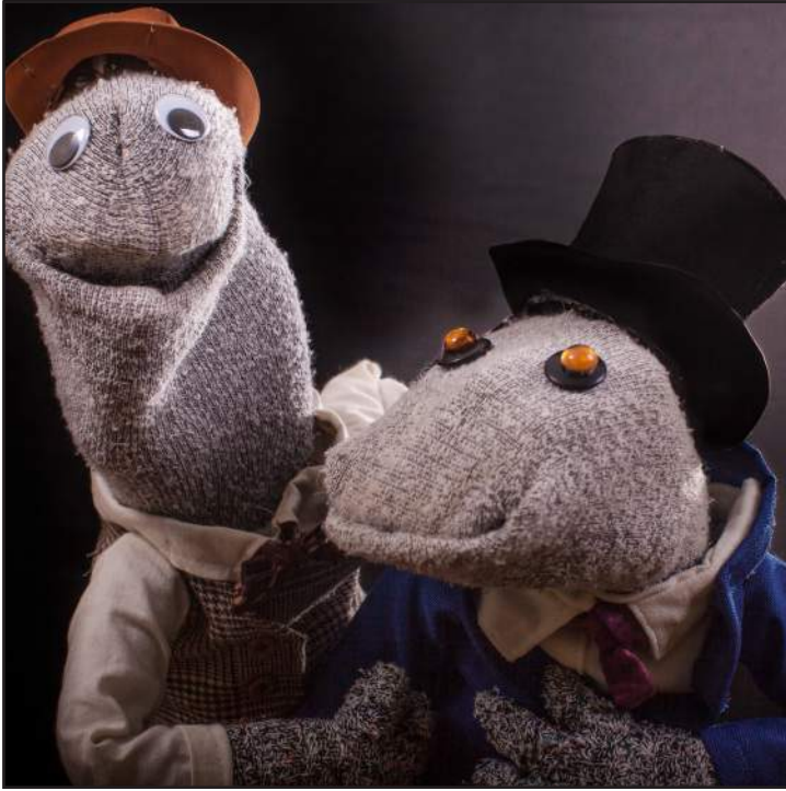
Bartleby & Artemus, a pair of paranormal investigating socks.