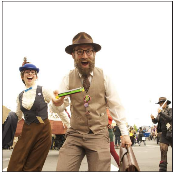
On and off the stage, we bring the paranormal to you!

Learn more & contact the Kinetic Paranormal Society for booking at: kineticparanormalsociety.com