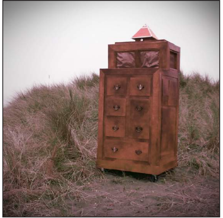
In their Magic Wardrobe the KPS travel through time and space.