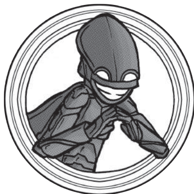
Devious N. Sidious

This single sock was once the KPS's biggest fan and now he is a full fledged member! Mango somehow manages to help the Neehi Bros. with his paranormal powers that even he doesn't know he has.